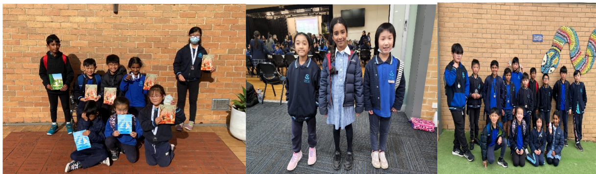
2 nd May