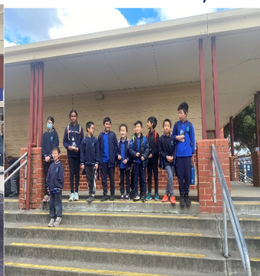
8 th June