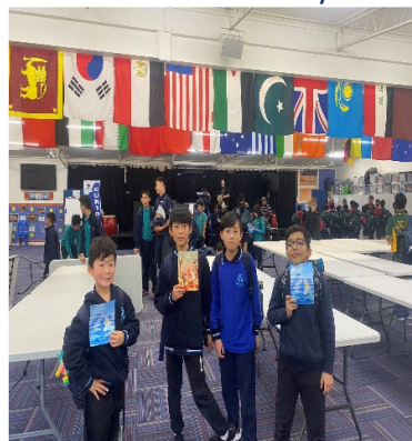
5 th June