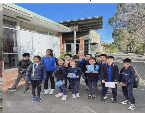
16 th June