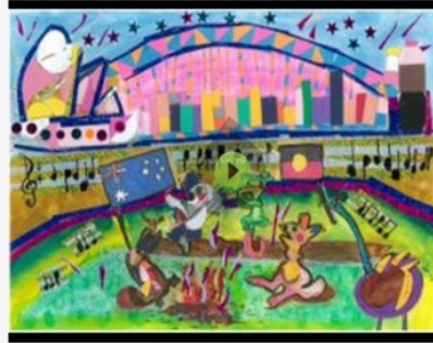
Sing Along With Aussie

Winner - Category 1 Primary School (Foundation to Level 3)