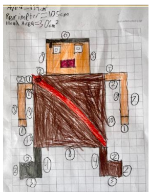
Robot portrait by Caleb 2M

The Grade 2s loved using hands-on materials and their creativity to build their courses.