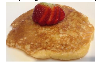
Pancakes made by Isabel 6N

There were heaps of fun and interactive activities for students to choose from such as making paper planes, designing and constructing their own bridge, making their own archery range, cooking pancakes, and many more. The students enjoyed participating in the virtual camp.