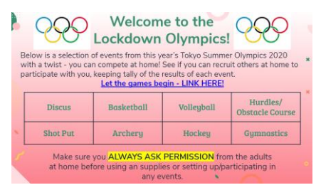
List of Lockdown Olympic events

The list included Lockdown Olympics (Doing Olympic Sports at Home), Designing your own medal, Olympics education (Learning about Olympics), Olympic Values (Learning about the Olympic Values) and more.