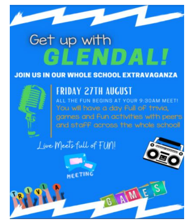
Get Up With Glendal promotion poster 1.

On Friday, the 27th of August, we introduced a whole school online learning event known as 'Get Up with Glendal'.