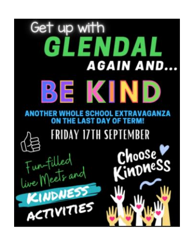
Get Up with Glendal promotion poster 2.

Due to the huge success of this first event, it was brought back by popular demand. On Friday, the 17th of September - the last day of the term, we will have a second 'Get Up with Glendal', this time with a theme based around kindness.