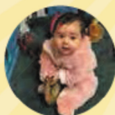
Birthday Party / Baby (Toddler) Play Group 生日派對 / 寶寶玩組