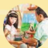
Arts and Craft 藝術手工課