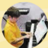
Piano / Organ / Guitar / Keyboard group / Bass / Violin / Cello 鋼琴 / 管風琴 / 吉他 / 鍵盤小組 / 低音提琴 / 小提琴 / 大提琴

Enjoy a variety of musical, art and language lessons. We provide fun and engaging group lessons for all ages as well as private tuition to enhance your skills in your chosen area. 我們提供多方面音樂藝術課程，年齡從幼兒到成年，從私人到小組授課。