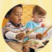
Music Baby Class 寶寶音樂課