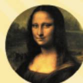
Oil Painting 油畫