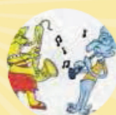
Clarinet and Saxophone 單簧管和薩克斯課