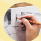
Drawing Class 美術